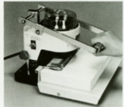
Can bore a hole up to 25mm (1") at a time.